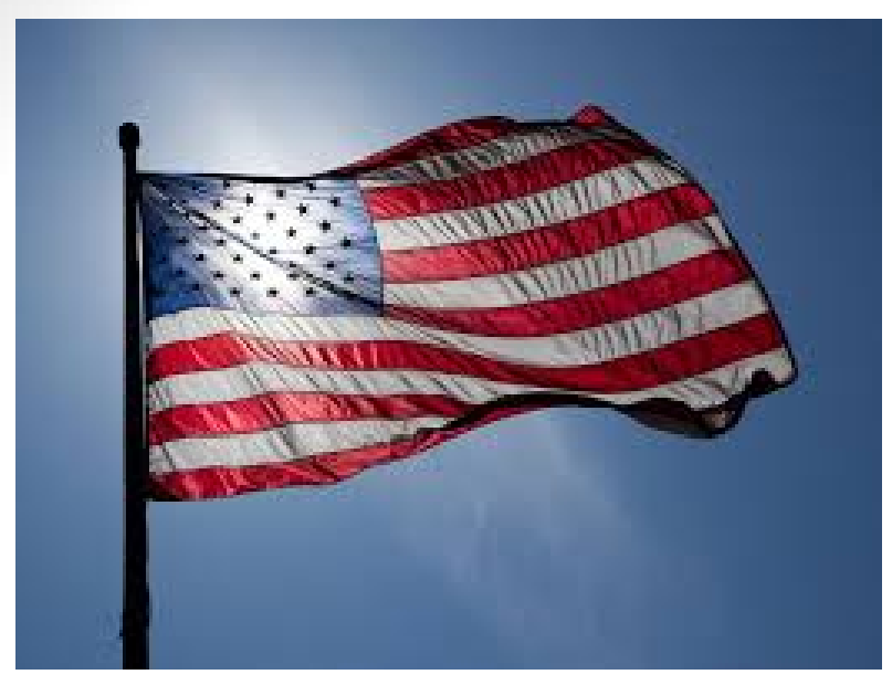
We do not own the copyright to this or other images in this presentation